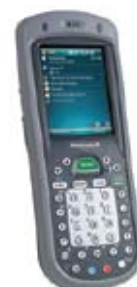
Dolphin 7600 Data Collector

chained to your desk, you are now free to roam your office, warehouse or branches completing these tasks easily and remotely. With the SIMMS Windows Mobile Program, you have the flexibility to choose your hardware and your budget.