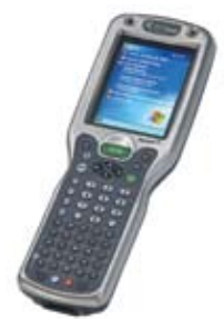
Dolphin 9500 Data Collector